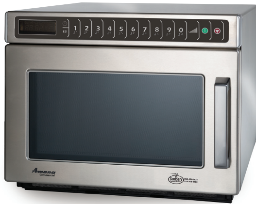
Model HDC12A2 shown