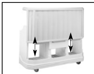
Detachable front for easy access to inventory and routing lines, tubes and hoses.