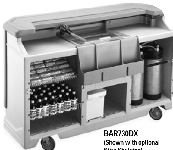
BAR730DX (Shown with optional Wire Shelving)