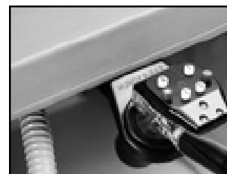
Premium quality 6-button, pre-mix soda gun by Wunder-Bar®.