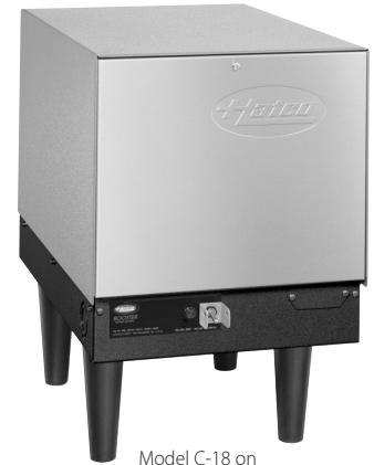
Model C-18 on 6" (152 mm) legs