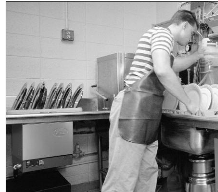
Water Temperature Recovery Table