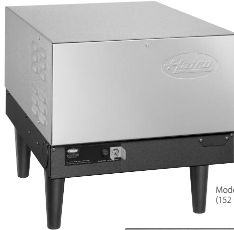
Model C-24 on 6" (152 mm) legs