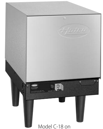
Model C-18 on 6" (152 mm) legs