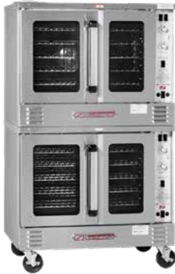
BGS/22SC shown with optional casters