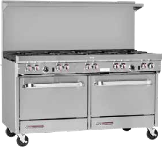
S60DD (shown with optional casters)