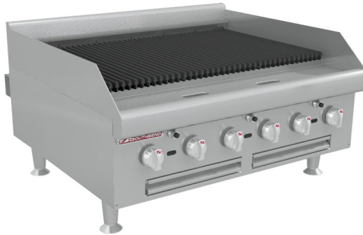
Model shown Model HDC-36