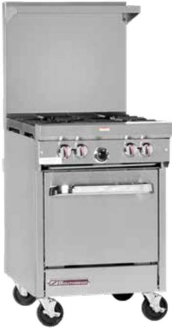
S24E (shown with optional casters)