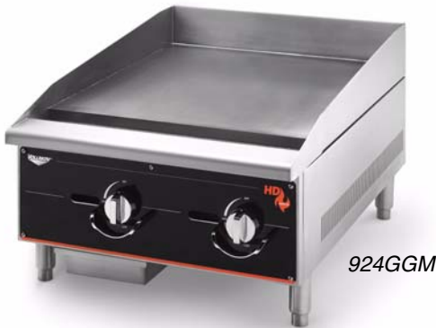
Cayenne® Heavy-Duty Gas Griddle