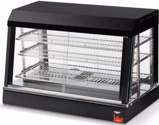
Cayenne® Hot Food Merchandiser