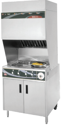
Model WV4HS SHOWN