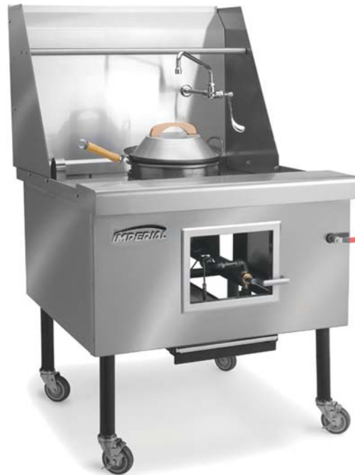
ICRA-1 shown with optional casters

3-ring burner has two adjustable gas valves for inner and outer rings.