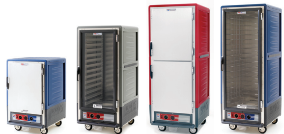
Blue ½ Height Full Solid Door