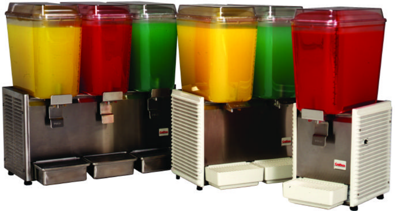
Model D35-3 (with cup activated handles)