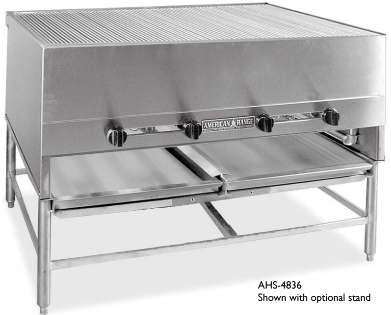
AHS-4836 Shown with optional stand